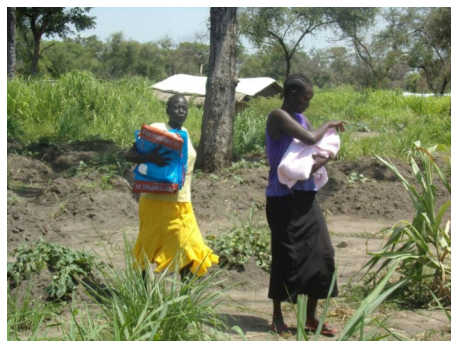
Mothers Walking Back to Camp After Receiving Mosquito Nets