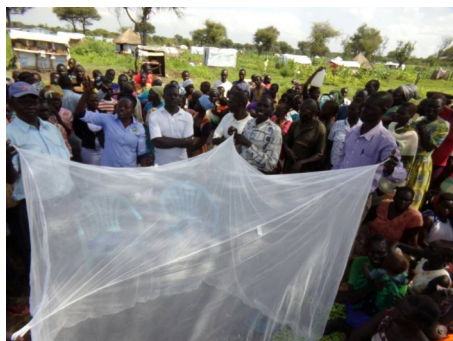
Doctors Demonstrating Use of Medicated Mosquito Net

The Healing Kadi Foundation work location has changed, but our mission, goals, dreams, ambitions, and love for the people of South Sudan has not wavered. Jesus Christ has called us to care for the people of South Sudan no matter what country they reside. We will continue to answer this call, knowing full well that as long as we follow and obey Christ, our work will continue to be successful, and most importantly, our Lord and Savior will be glorified in the process.