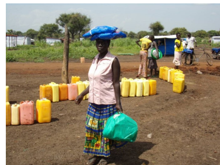
Lady Walking Back to Camp After Receiving Mosquito Nets