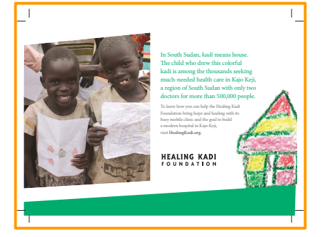
Example of card back