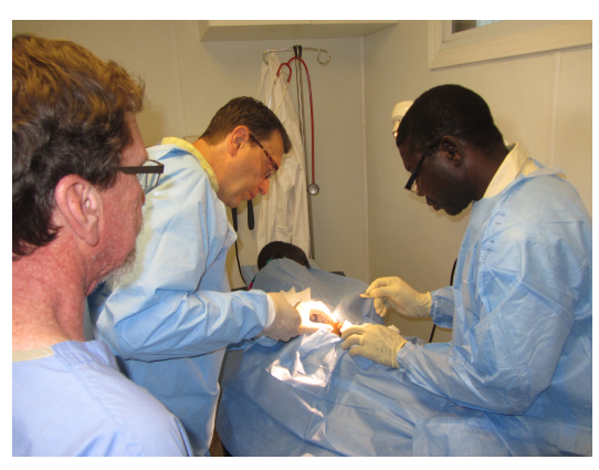
HKF doctors performing outpatient surgery at MMMC

Have you ever considered joining HKF on a medical mission trip? We have scheduled the dates of our 2016 medical mission trip. Our team will leave for Kajo Keji either March 23<sup>rd</sup> or March 27<sup>th</sup> and return on April 6<sup>th</sup>. Those who depart on March 23<sup>rd</sup> will spend a few days at a medical clinic in Uganda before the rest of the team arrives and the entire group leaves for Kajo Keji.